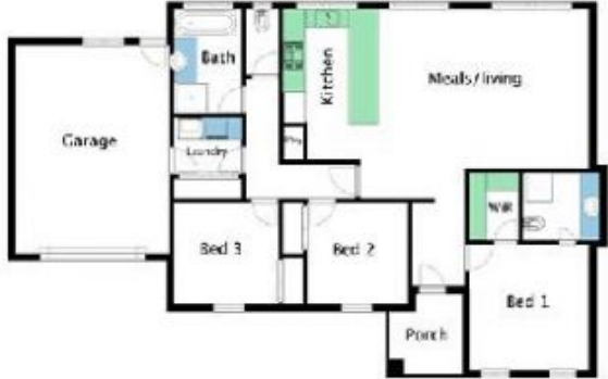
Unit 1, 7 Chandler Ct. Wangunyah