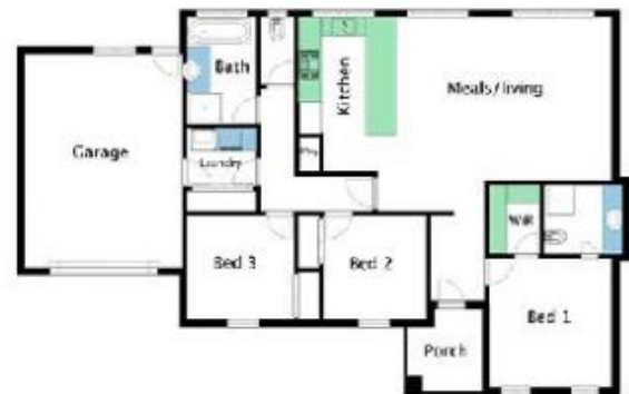
Unit 1, 7 Chandler Ct. Wangunyah