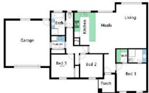
Unit 2, 7 Chandler Ct. Wangunyah