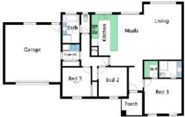
Unit 2, 7 Chandler Ct. Wangunyah