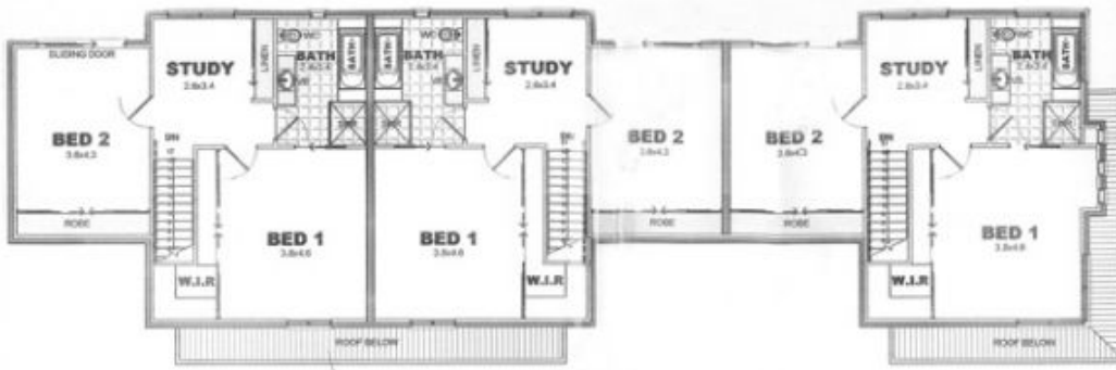
FIRST FLOOR PLAN 1:100